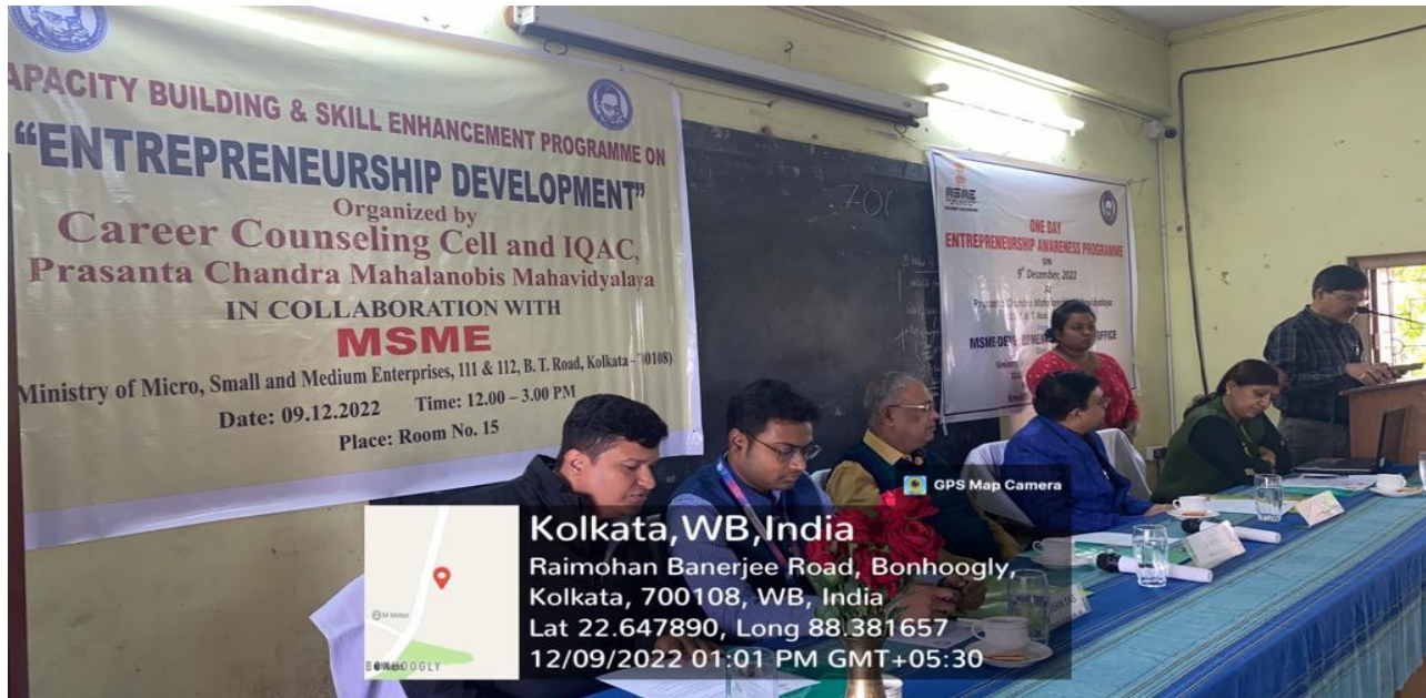
Entrepreneurship Development Programme