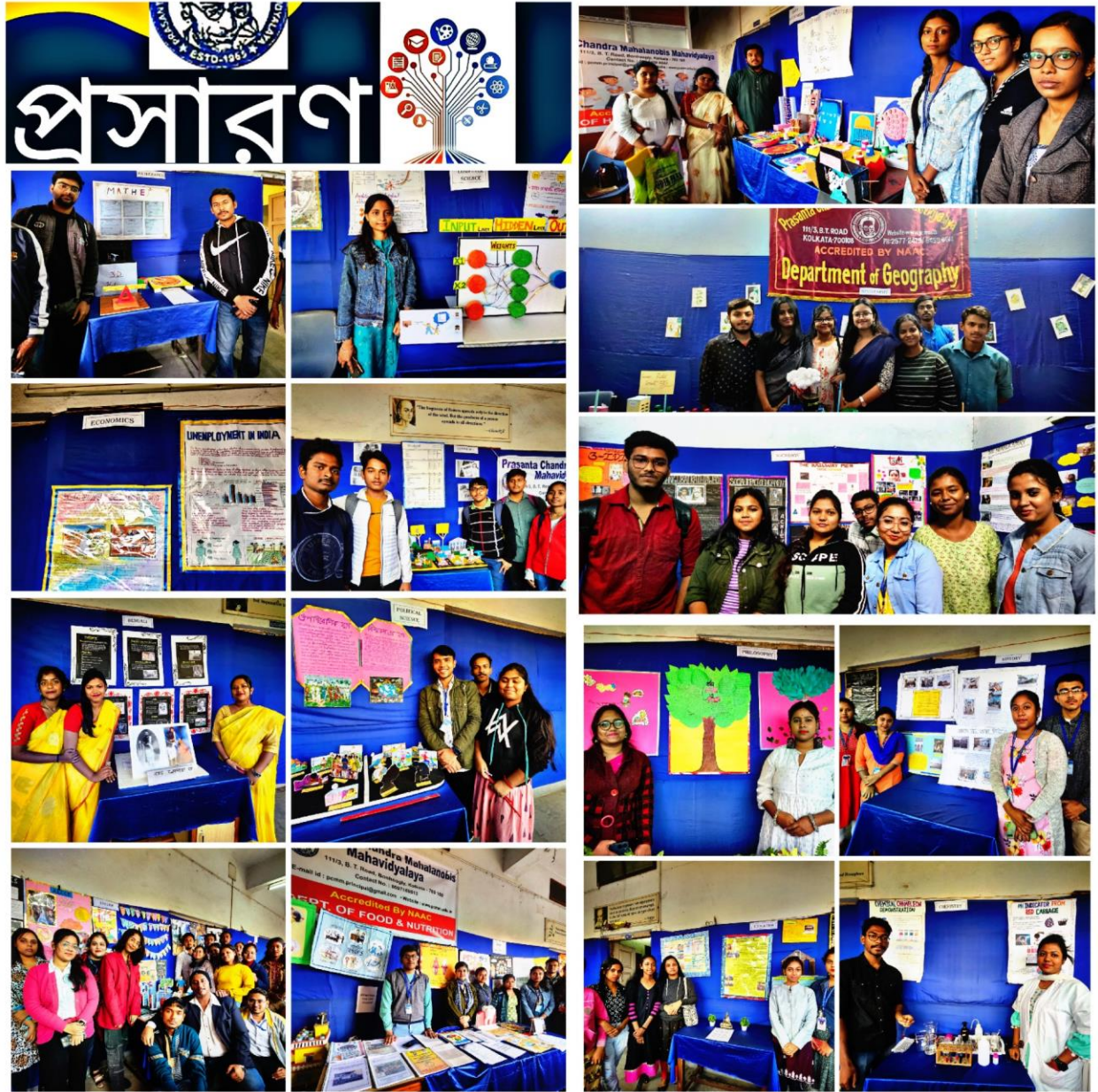
Prasaran: Inter Disciplinary Exhibition