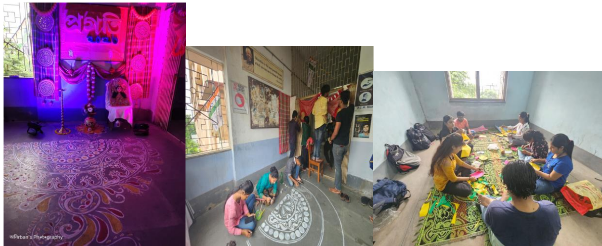
Pragati: Pre Puja Exhibition Cum Sale